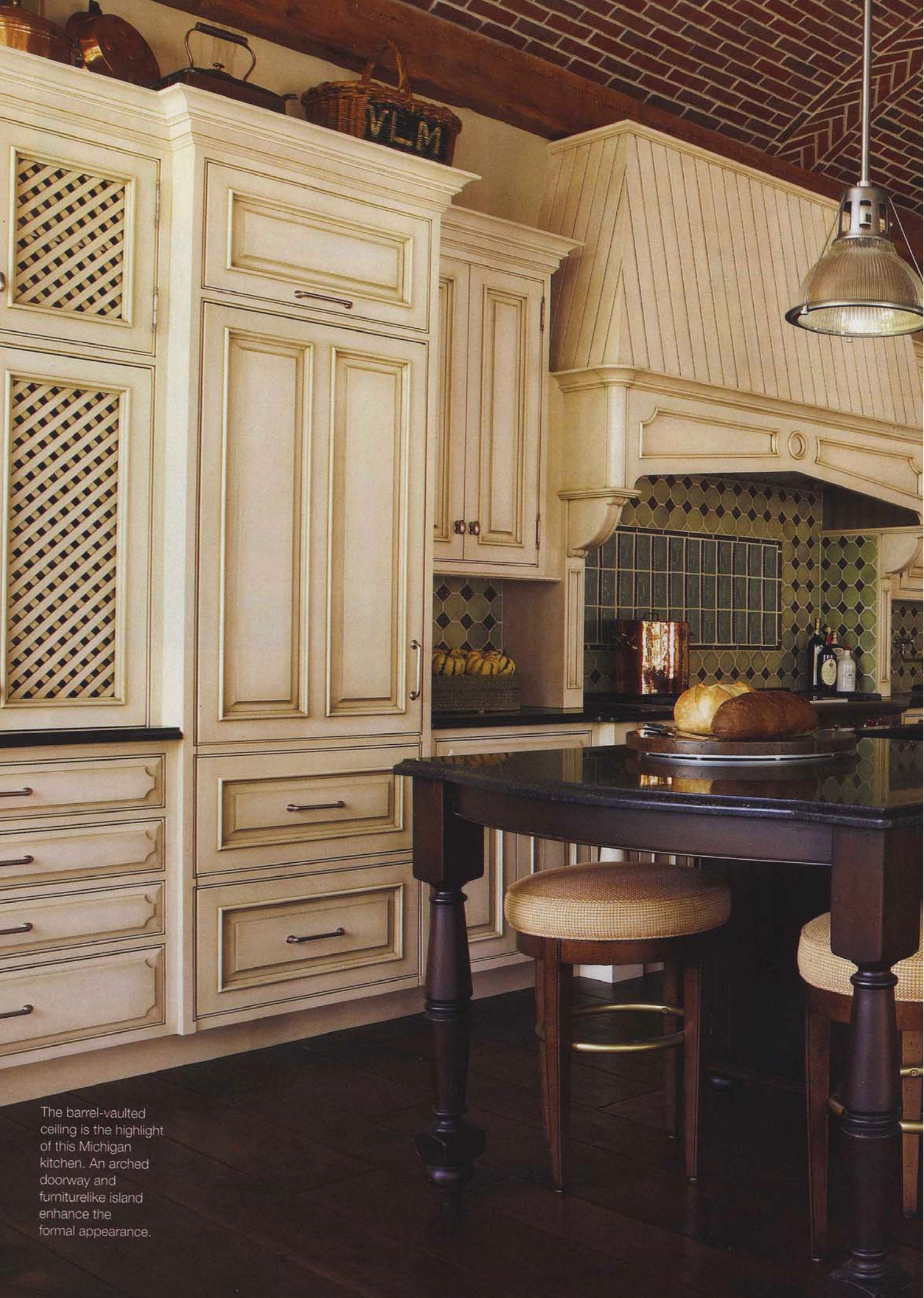
The barrel-vaulted ceiling is the highlight of this Michigan kitchen. An arched doorway and furniturelike island enhance the formal appearance.