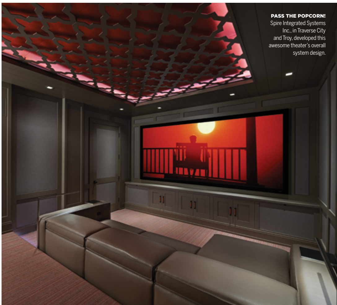
PASS THE POPCORN! Spire Integrated Systems Inc., in Traverse City and Troy, developed this awesome theater's overall system design.