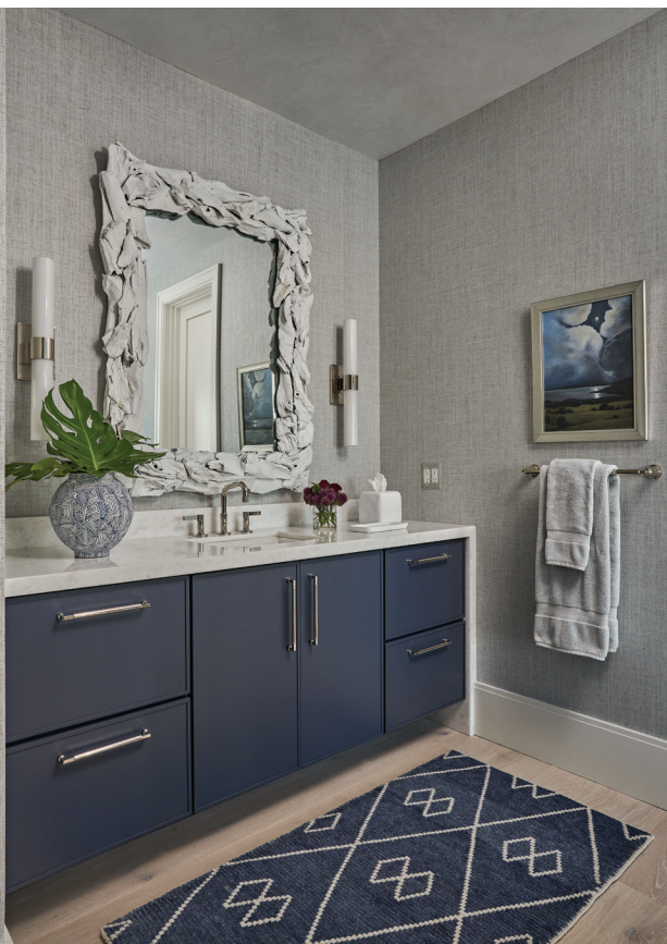
Left: The primary bathroom is one of two rooms with blue accents. The house is more about texture, though, than color. For example, the mirror's ultra-tactile driftwood surface adds plenty of "wow."