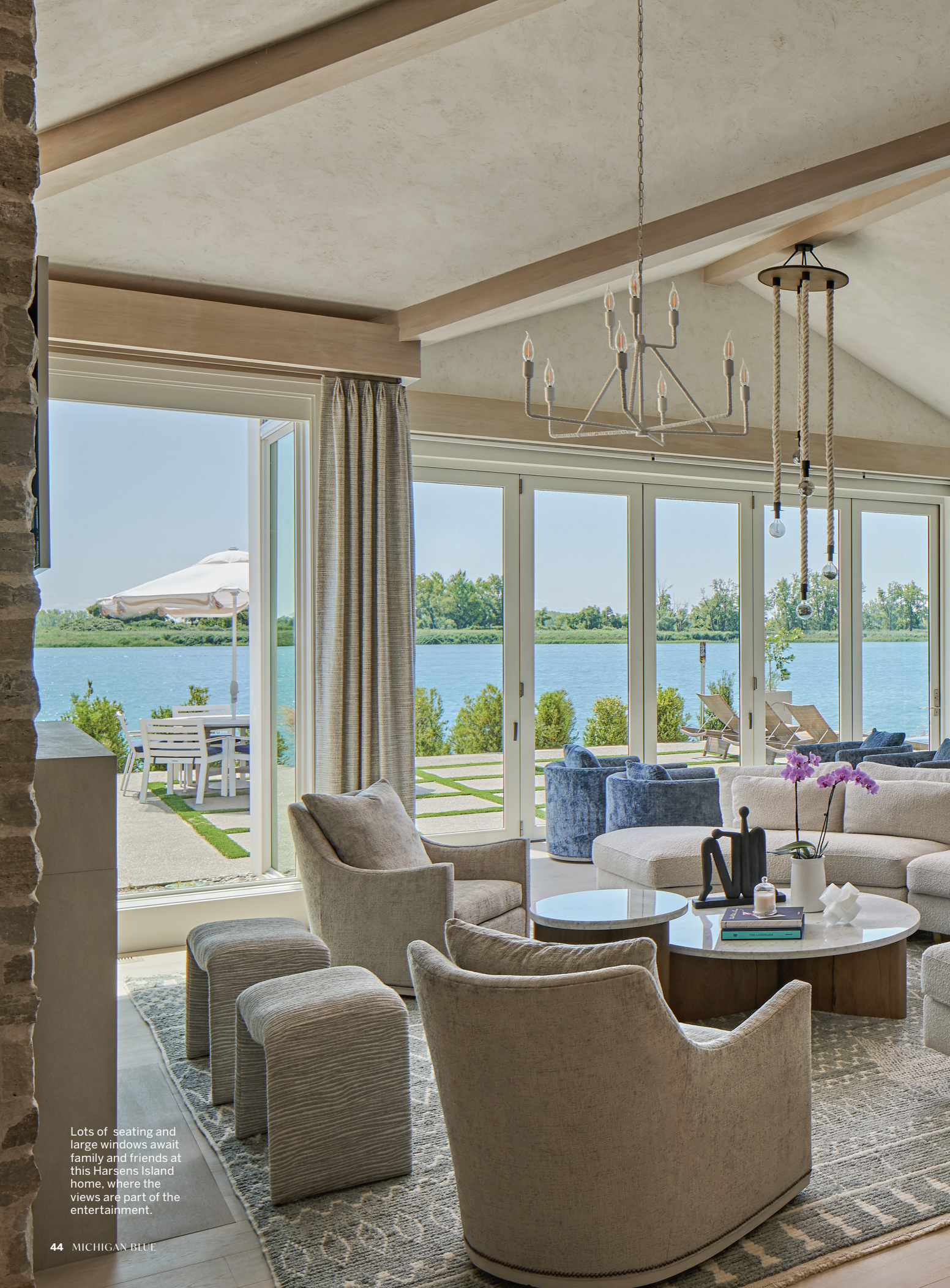
Lots of seating and large windows await family and friends at this Harsens Island home, where the views are part of the entertainment.